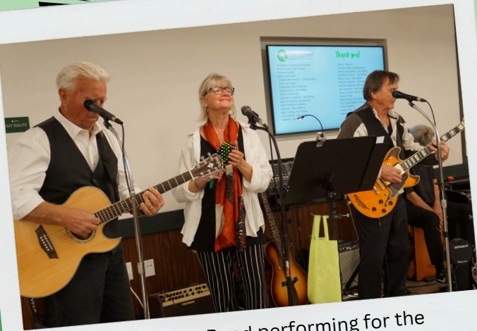
The Flashbacks Band performing for the IHSS Registry Caregivers

THANK YOU TO ALL OUR SPONSORS AND OVER 100 GUESTS WHO CELEBRATED OUR IHSS REGISTRY CAREGIVERS!