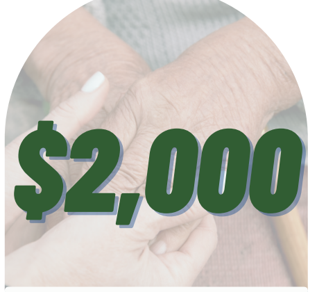
INCENTIVE 3 Completing 15 hours of Training in the Specialized Career Pathway AND Working for a new Recipients for 6 Months

Completing 15 hours of Training in the Specialized Career Pathway AND Working for a new Recipient for 1 Month